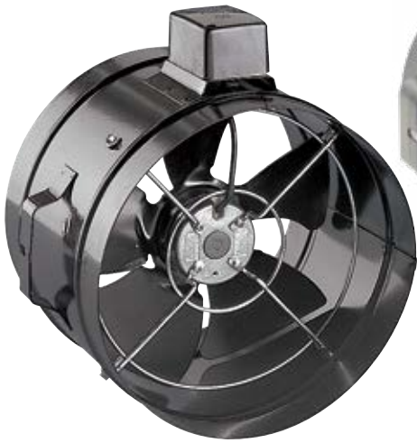
Metal construction model (MTS)