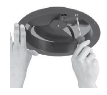
Fig. 2 - Tightening mounting screws