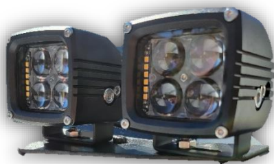
Quad (2 on each side)

*We have an installation video on our website and YouTube Channel