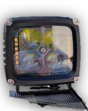
Dual (1 on each side)

40watt pillars Mounting plates Mounting hardware M&R Wiring Harness