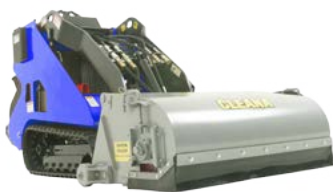
Mini Broom also available