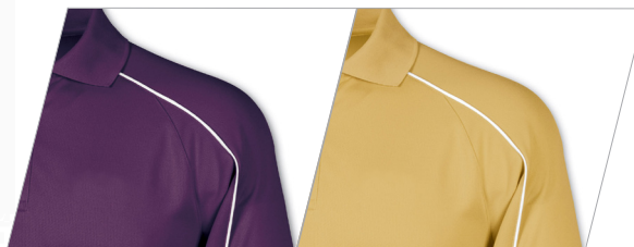
Purple / White