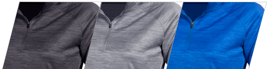
Black Melange / Black