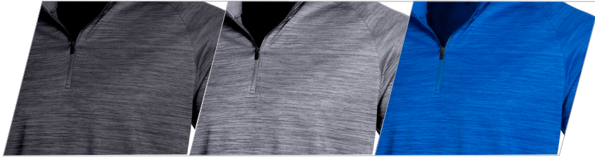
Black Melange / Black