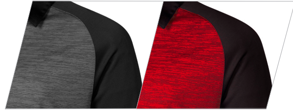
Black/Grey/ Black Stripe