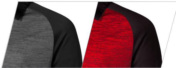
Black/Grey/ Black Stripe