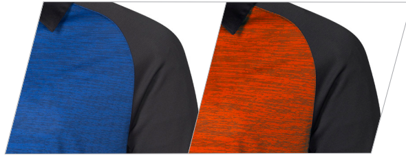
Black/Royal/ Black Stripe