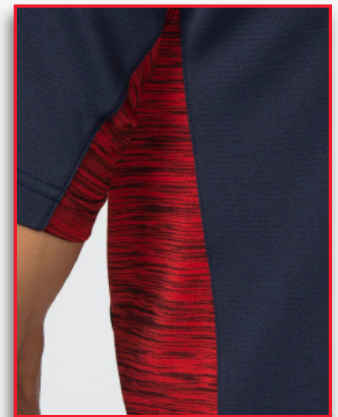
Melange Stripe Pattern ▶