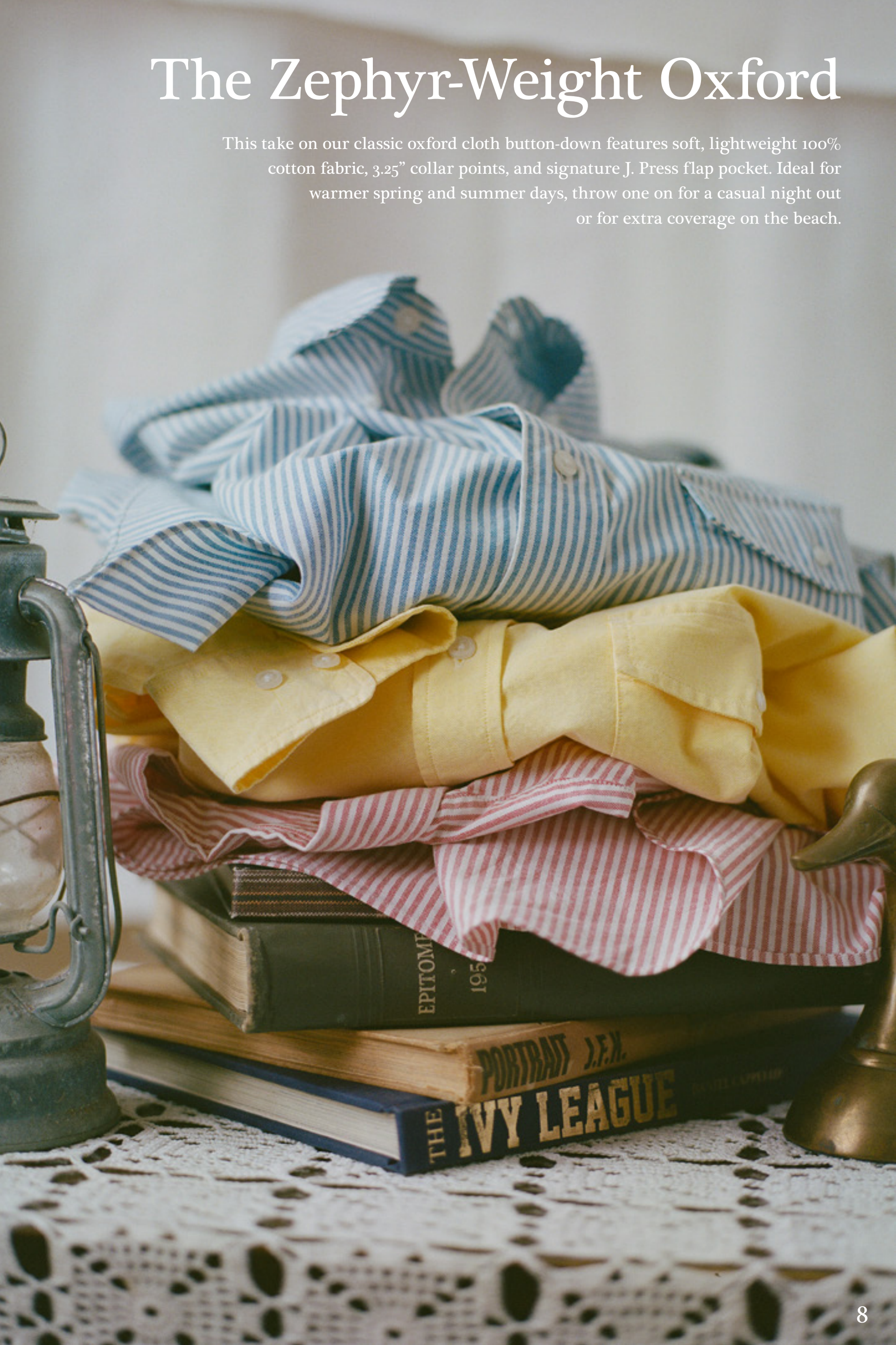
This Page: Yellow Zephyr Weight Oxford Sport Shirt $98.50 PHS0206FG; Blue Zephyr Weight Oxford Sport Shirt $98.50 PHS0206FG; White 5-Pocket Pants $98.50 PPP9001SF

This take on our classic oxford cloth button-down features soft, lightweight 100% cotton fabric, 3.25" collar points, and signature J. Press flap pocket. Ideal for warmer spring and summer days, throw one on for a casual night out or for extra coverage on the beach.