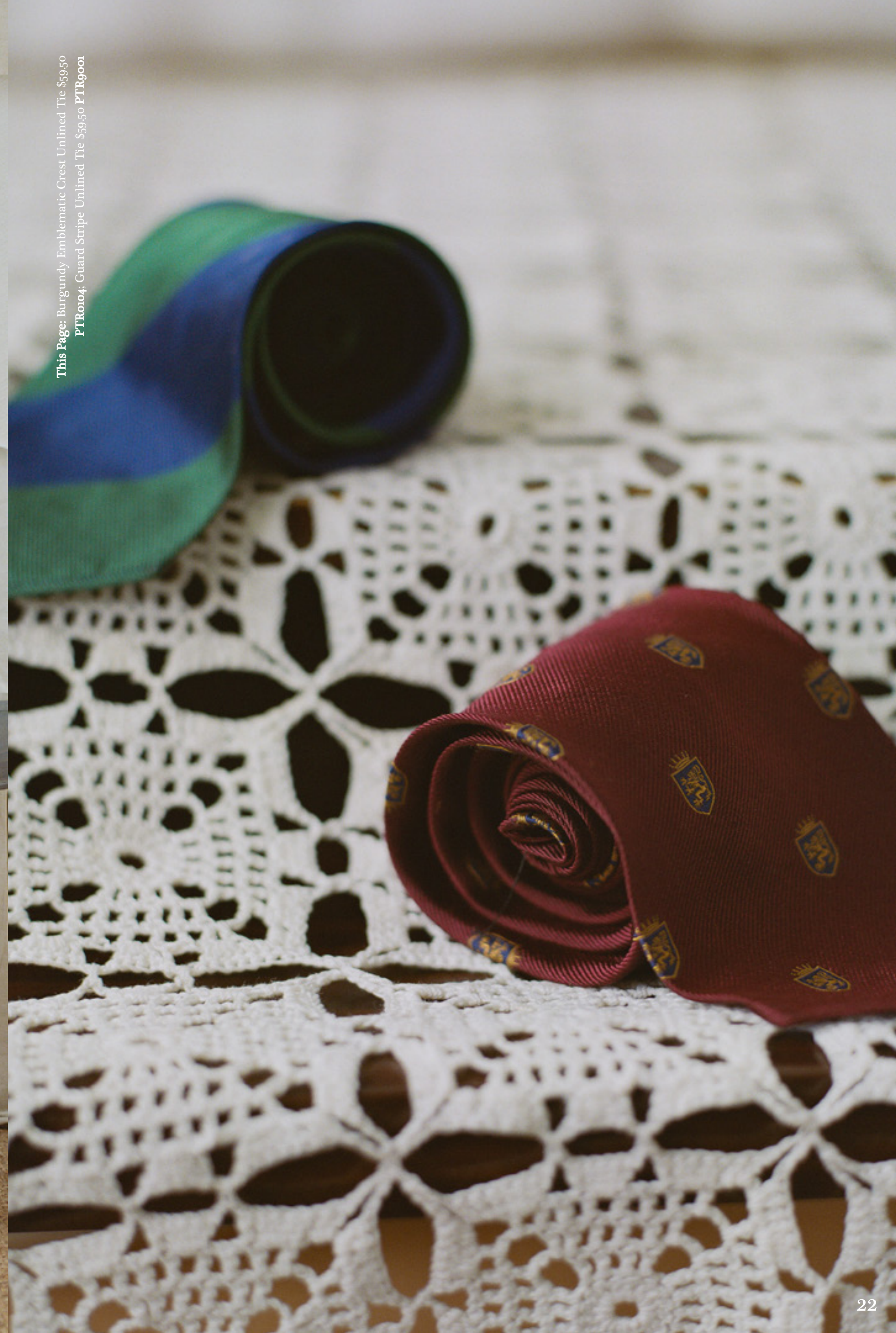
This Page: Burgundy Emblematic Crest Unlined Tie $59.50 PTR0104 ; Guard Stripe Unlined Tie $59.50 PTR9001