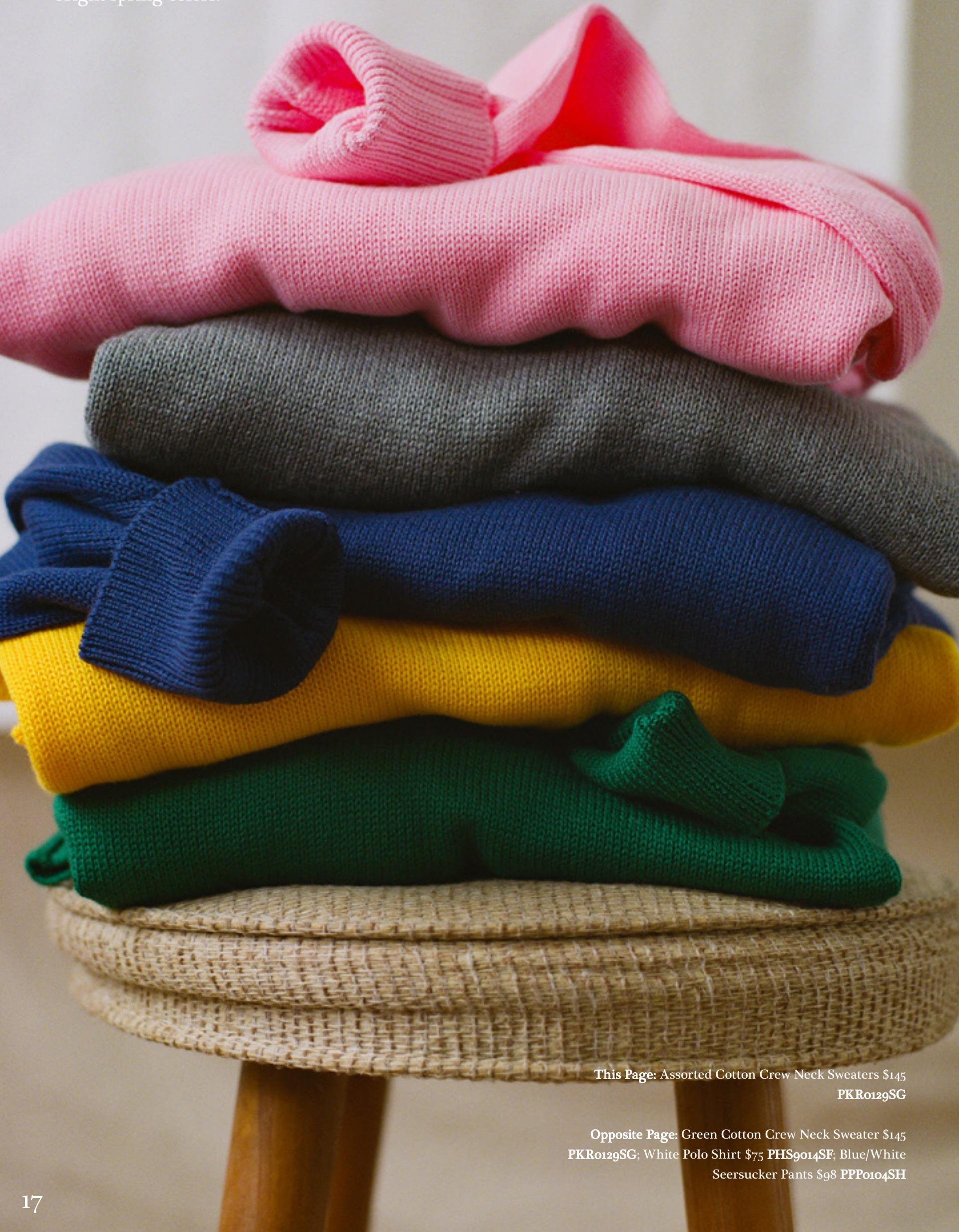
This Page: Assorted Cotton Crew Neck Sweaters $145 PKR0129SG

Perfect for the transitional season, our cotton sweaters are available in a range of bright spring colors.