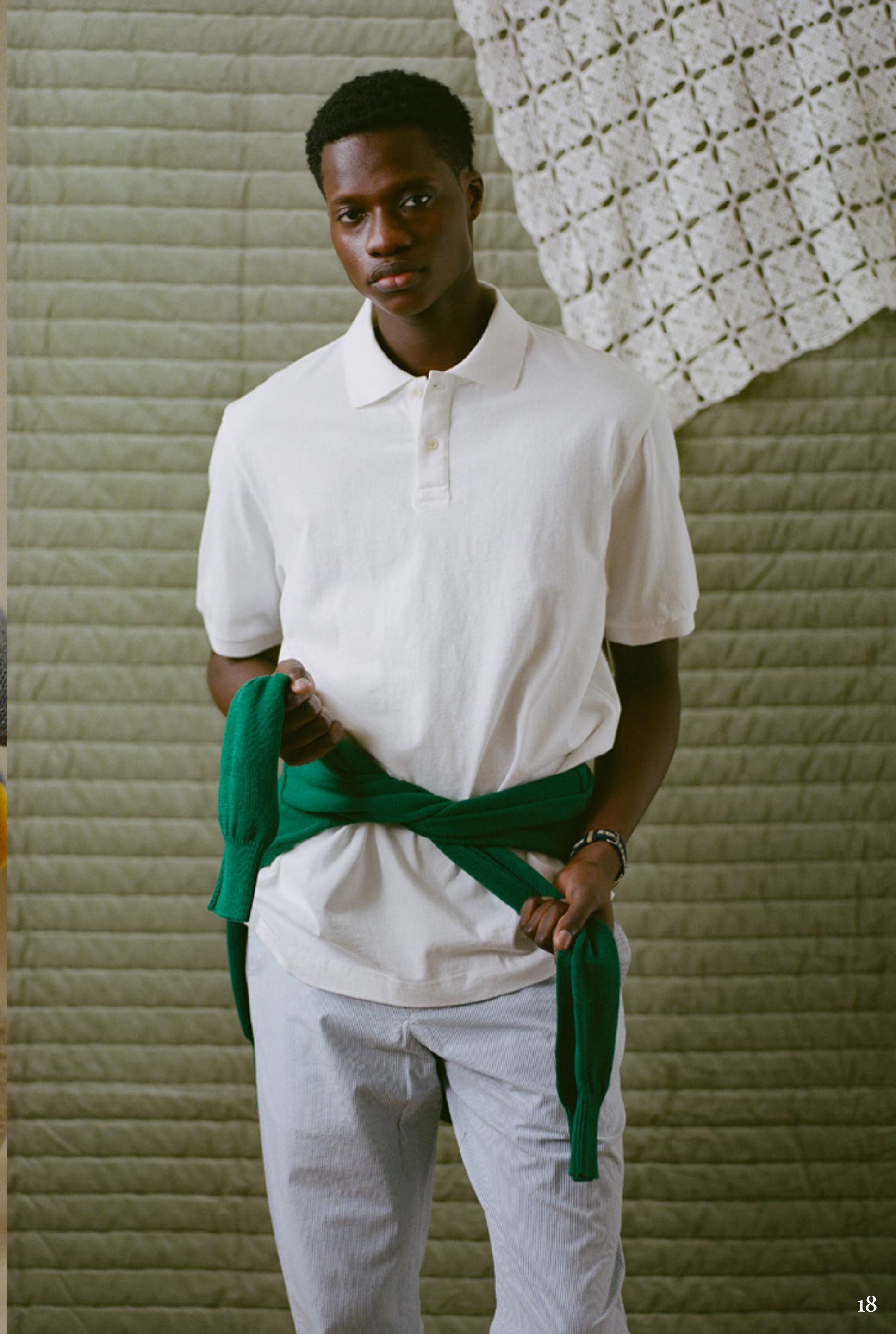
Opposite Page: Green Cotton Crew Neck Sweater $145 PKR0129SG; White Polo Shirt $75 PHS9014SF; Blue/White Seersucker Pants $98 PPP0104SH