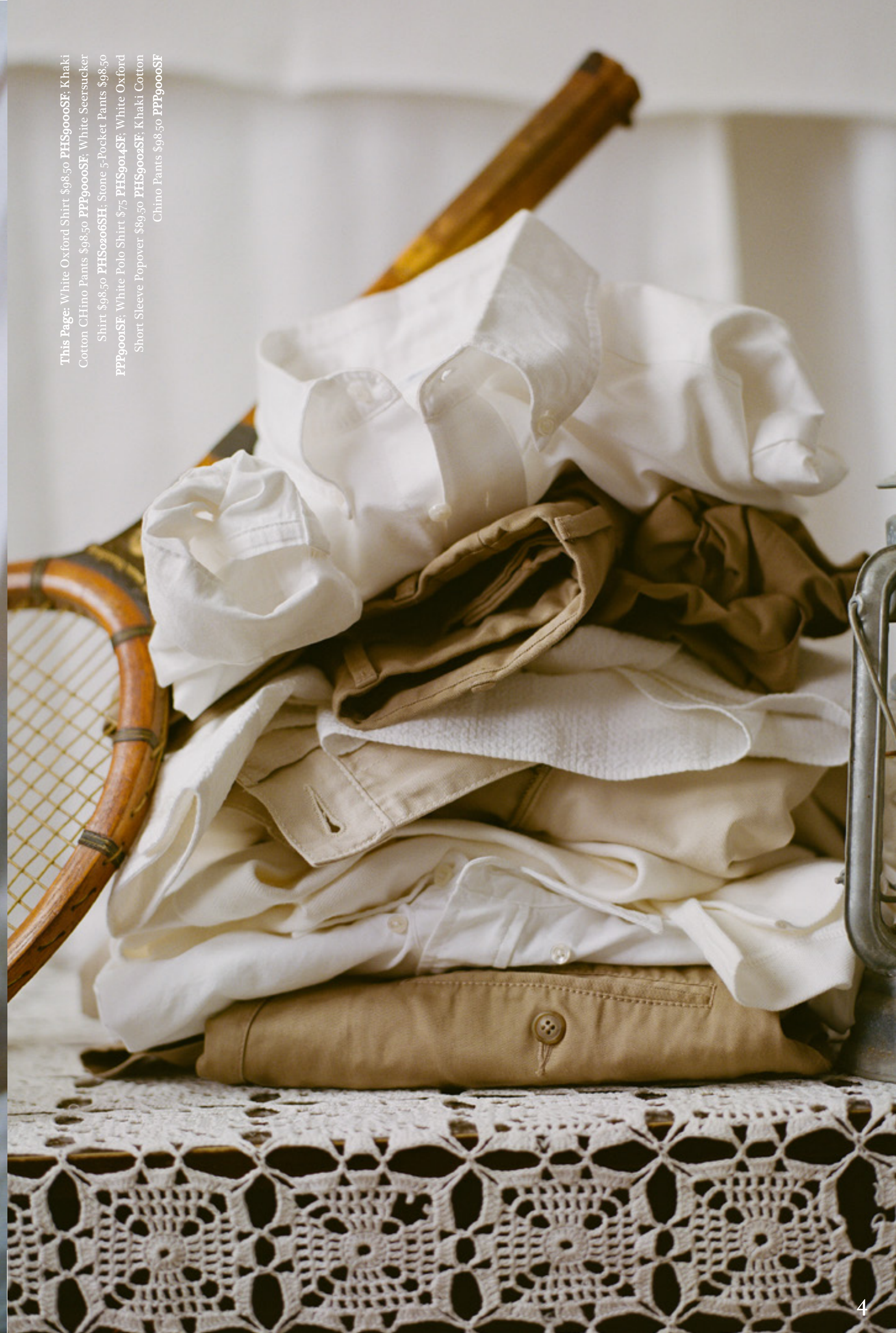
This Page: White Oxford Shirt $98.50 PHS9000SF ; Khaki Cotton Chino Pants $98.50 PPP9000SF ; White Seersucker Shirt $98.50 PHS0206SH ; Stone 5-Pocket Pants $98.50 PHS9014SF ; White Polo Shirt $75 PHS9014SF ; White Oxford Short Sleeve Popover $89.50 PHS9002SF ; Khaki Cotton Chino Pants $98.50 PPP9000SF