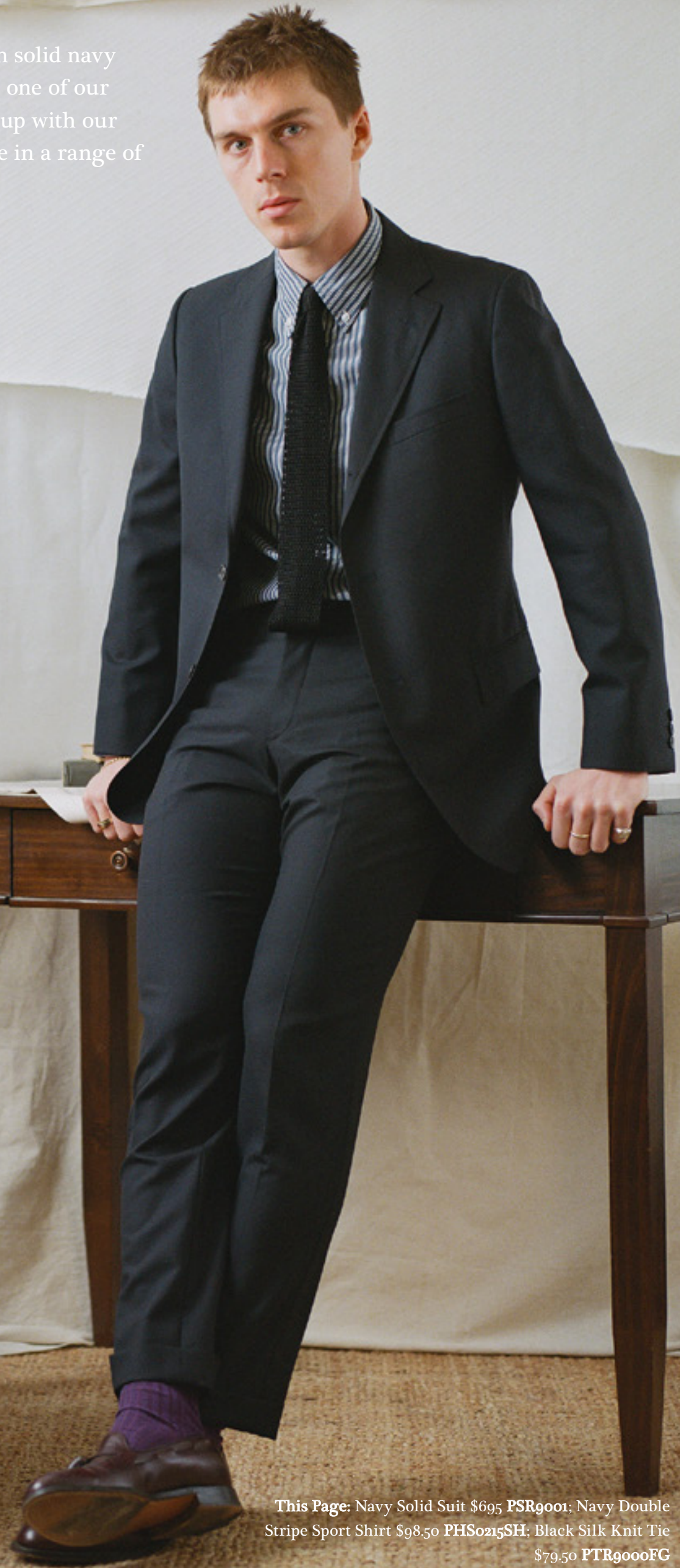
This Page: Navy Solid Suit $695 PSR9001 ; Navy Double Stripe Sport Shirt $98.50 PHS0215SH ; Black Silk Knit Tie $79.50 PTR9000FG

Shop our basic sack suits, available in solid navy and charcoal. Dress them down with one of our patterned sport shirts or dress them up with our traditional dress shirts, now available in a range of fabrics and collar styles.