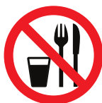
DO NOT EAT

PROJOINT FUSION IS NOT A TOXIC PRODUCT. HOWEVER CARE SHOULD BE TAKEN NOT TO INGEST THIS PRODUCT. IF INGESTED SEEK MEDICAL ATTENTION IMMEDIATELY. IF PRODUCT GETS INTO EYES RINSE THOROUGHLY WITH WATER AND SEEK MEDICAL ATTENTION.