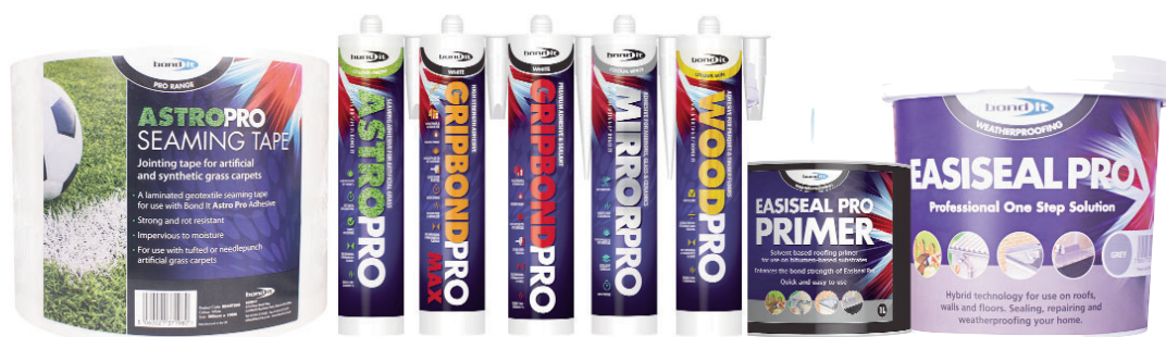
Part of the Bond It Pro Hybrid Sealants & Adhesive Range

The data presented in this leaflet are in accordance with the present state of our knowledge, but do not absolve the user from carefully checking all supplies immediately on receipt. We reserve the right to alter product constants within the scope of technical progress or new developments. The recommendations made in this leaflet should be checked by preliminary trials because of conditions during processing over which we have no control, especially where other companies raw materials are also being used. The recommendations do not absolve the user from the obligation of investigating the possibility of infringement of third parties rights and, if necessary clarifying the position. Recommendations for use do not constitute a warranty, either expressed or implied, of the fitness or suitability of the products for a particular purpose.