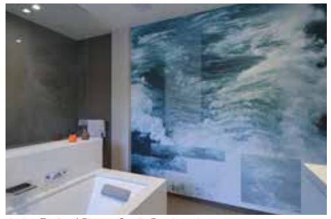
design Estrikor I Photo : Studio Rembrandt