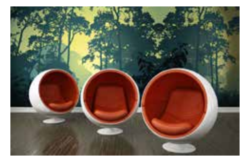
ref. Mulhousian spirit of panoramic scenery