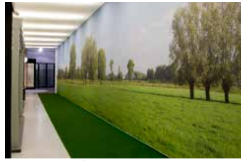
showroom Decoranda Larch, d'intérieur : Kurt Wallaves

Technical elements such as switches or electric outlets are perfectly integrated within artolis ® system.