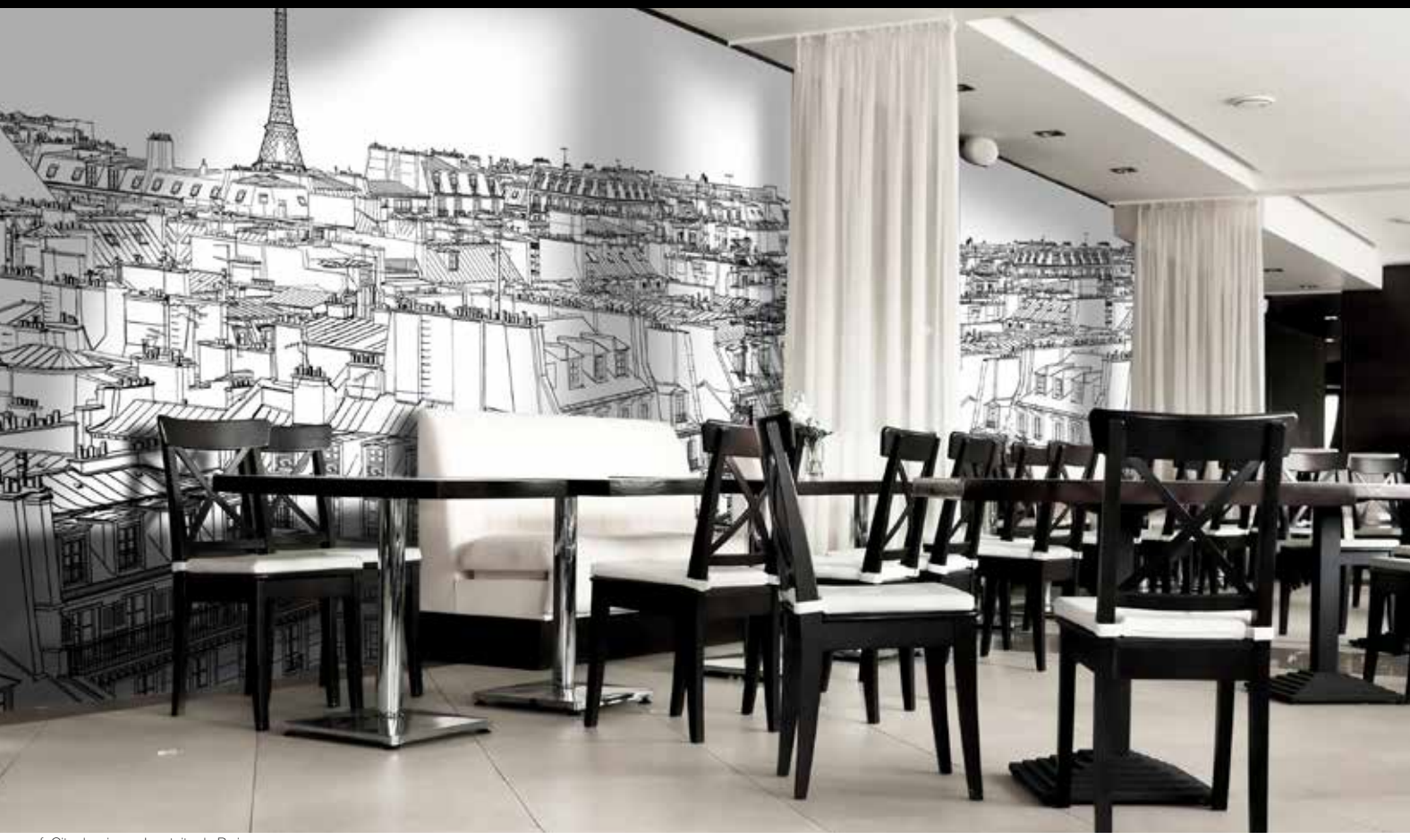
ref. City drawings - Les toits de Paris