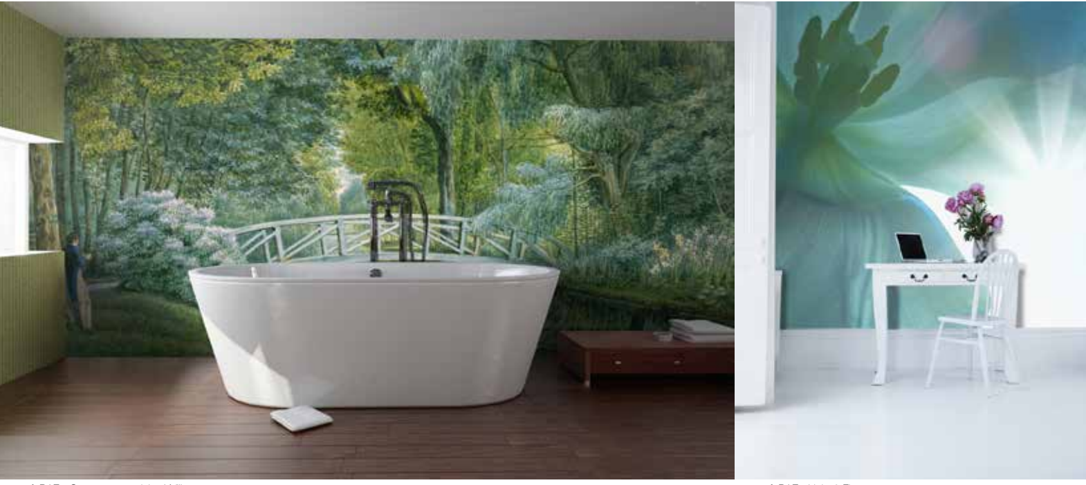
ref. BAE - Campagne anglaise \mathsf{XVIII}^{\mathsf{eme}}