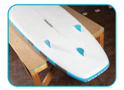
1) Fixed Fin which has three fins permanently attached to the board.