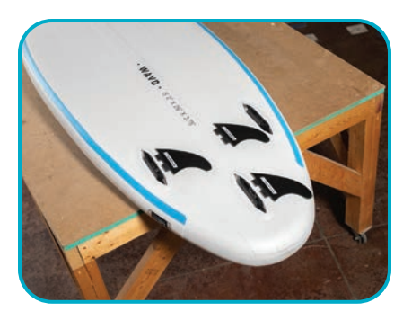
3) Removable Tri-fin which has three removable Click Fins.