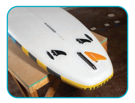
2) Removable Two Plus One which has a 10" center fin box and two Click Fin side bites.