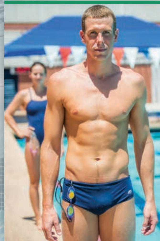
MALE BRIEF Product Code: A3XBP4

Visit a3performance.com to see our newest prints!