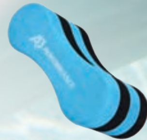
PRO PULL BUOY