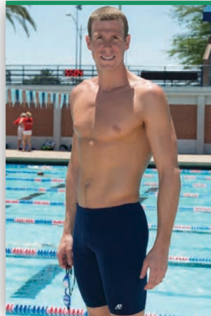
MALE JAMMER Product Code: A3XJP