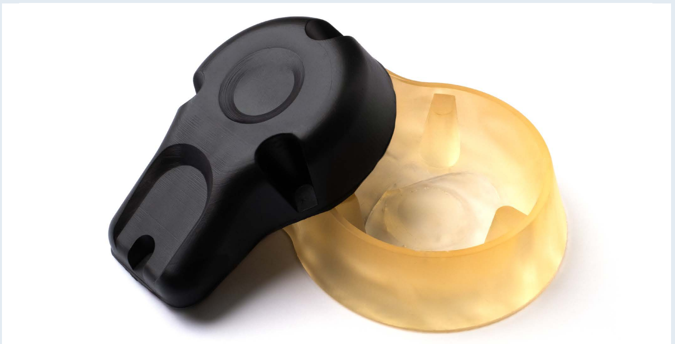
4mm ABS Multiplier-made product casing prototype and 3D printed template

The simplified workflow for producing replacement covers improved the efficiency of maintenance operations.