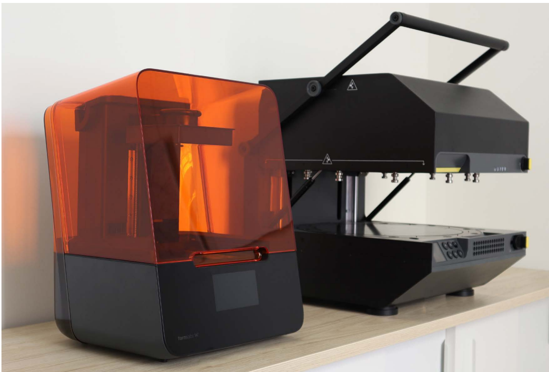
Formlabs Form 3 SLA 3D printer and Mayku Multiplier

The compact size and ease-of-use of the Multiplier makes it easy to fit into existing workspaces. Combined with the high-resolution capabilities of SLA 3D printing, it can produce injection mold-quality parts on the desktop within minutes.