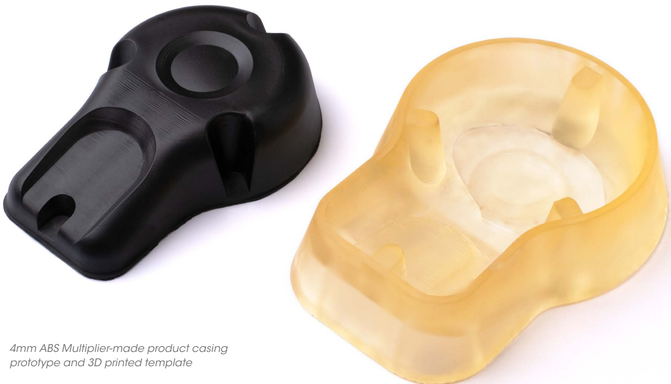
4mm ABS Multiplier-made product casing prototype and 3D printed template

Repeat the pressure forming cycle for each part to achieve a consistent run. Check the template after each cycle to ensure it has not been damaged.