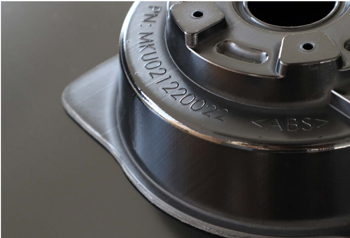
4mm ABS part made with the Mayku Multiplier