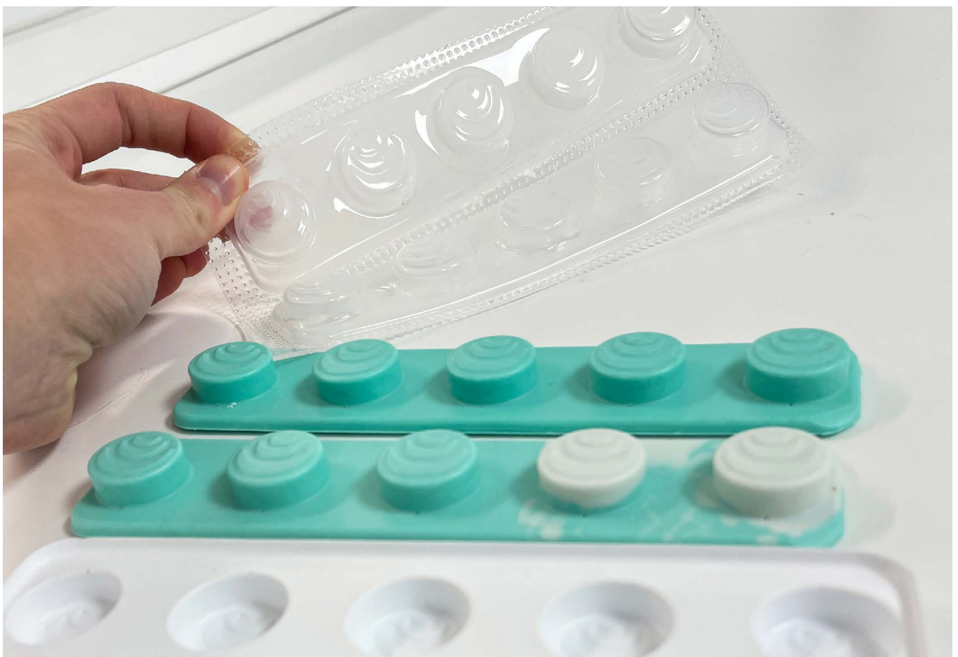
Above: Final molds and templates used with the Mayku Multiplier