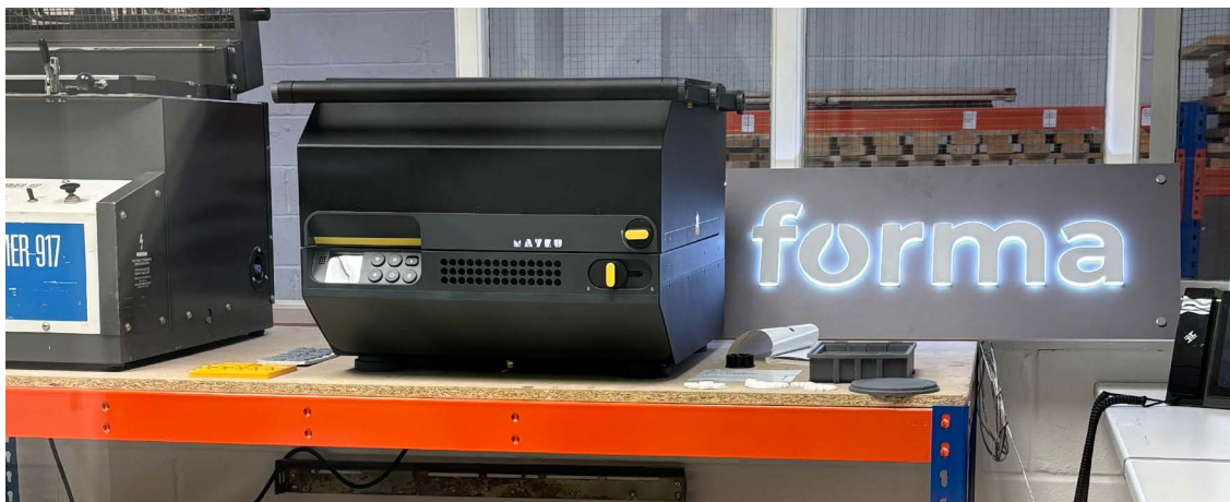
Left: The Mayku Multiplier in the Forma Moulds workshop

They then cast high shore hardness silicone into this EVA mold to make extra sets of tooling. Multiplying their tooling with this process enabled them to produce more molds from a single sheet of Mayku material as several tools can be placed on the bed of the Multiplier at once, increasing their yield per sheet.