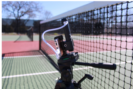
Radar beam aimed at point of contact