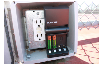
Rechargeable AAA batteries