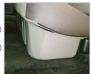
This is how the DU-HA should look installed under the back seat.

Pull the lever under (or on the side) of each back seat to return the seat bottoms to the down position.