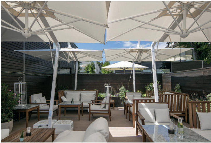
FALKENSTEINER - AUSTRIA