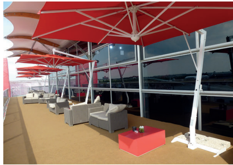
FARNBOROUGH AIRPORT - UK