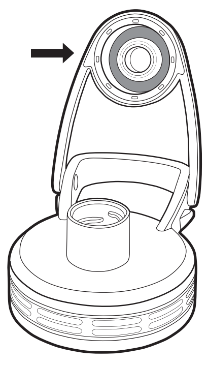
Small O-Ring (Drinking Spout Cap)