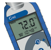
Max/Min feature recalls highest and lowest reading