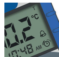
Count-down timer and alarms