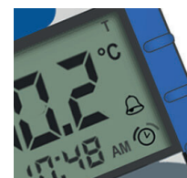
Count-down timer and alarms