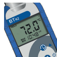
Max/Min feature recalls highest and lowest reading