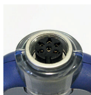
Secure Lumberg Connector

Rugged Waterproof Polycarbonate Case with BioCote® Antimicrobial Protection