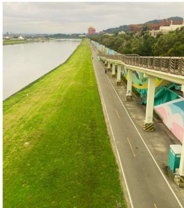
Dedicated cycle pathways , Brompton

"Truly a unique experience designed for your Brompton!"