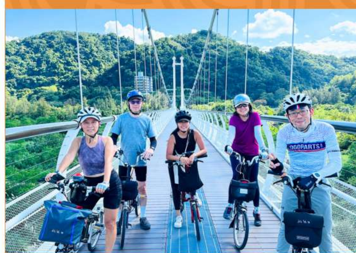
EPIC BRIDGE CROSSING