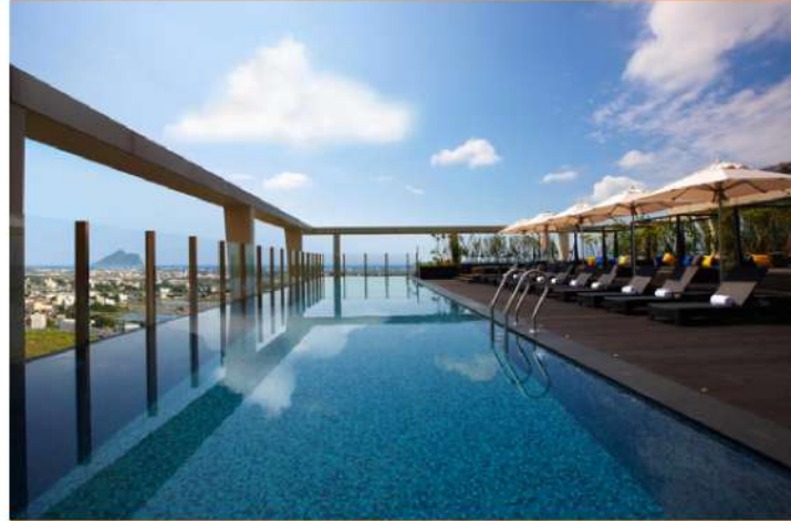
WELLSPRINGS BY SILKS