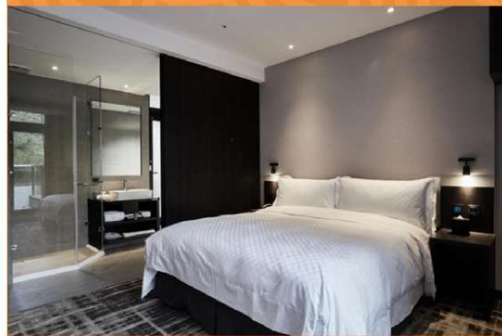
TANGO TAIPEI SHILIN