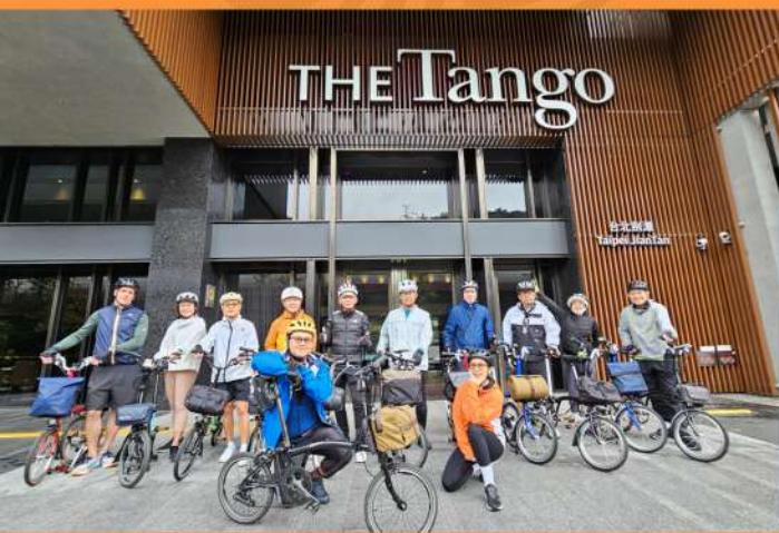
TANGO TAIPEI SHILIN