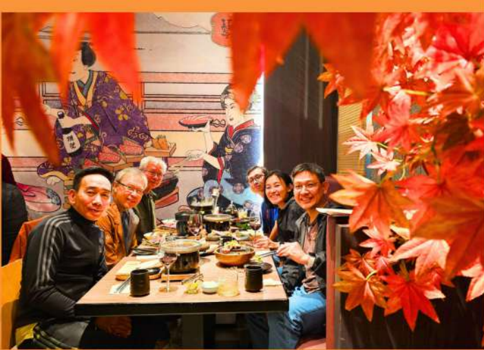
SHARE EXPERIENCES OVER DINNER