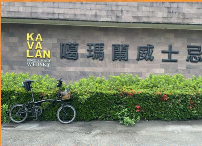
UNIQUE POINTS OF INTEREST