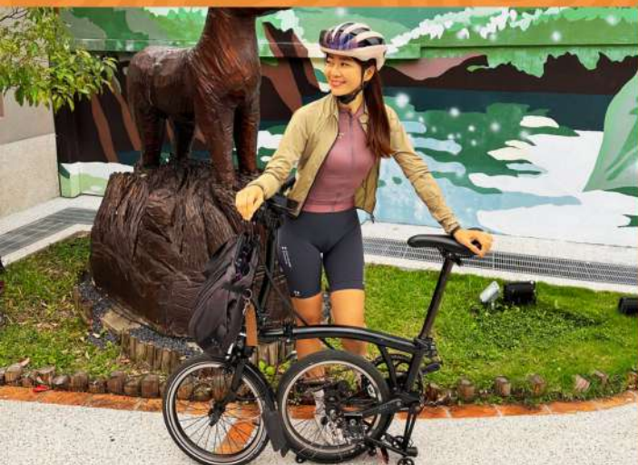
KEEP UP WITH OUR PACERS