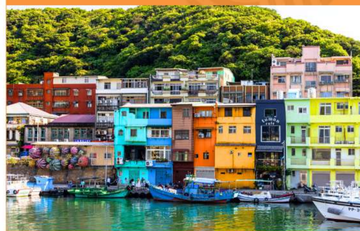
CHARMING OLD TOWNS