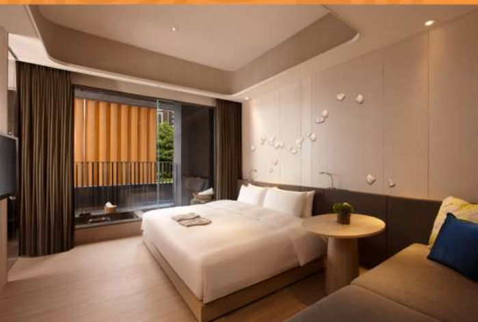
WELLSPRINGS BY SILKS