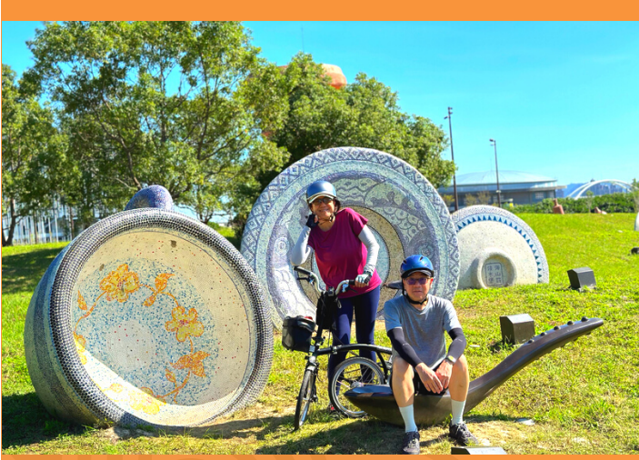
UNIQUE POINTS OF INTEREST

*Map route for illustration purposes only. Details upon request.