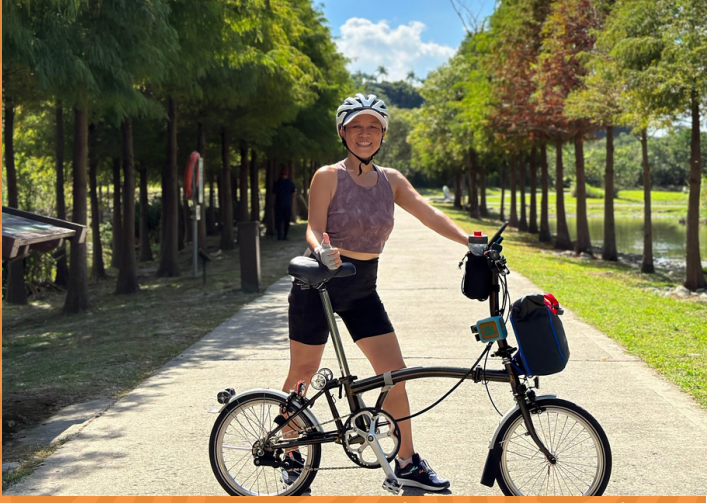
DEDICATED BIKE TRAILS