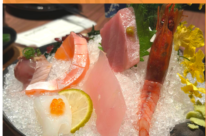
VARIETY OF CUISINE