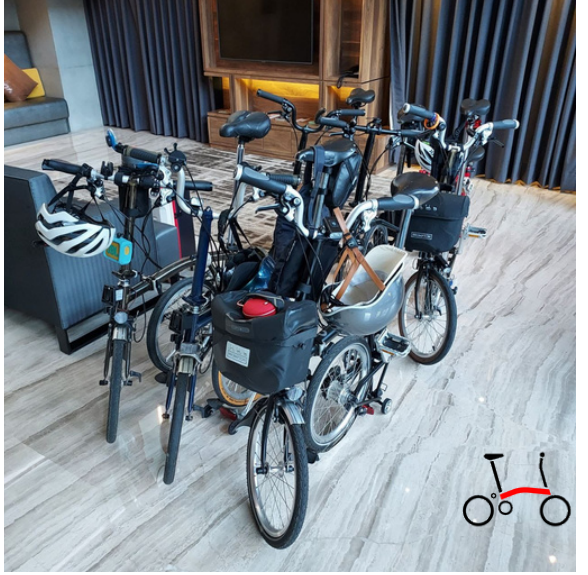
Guest Relations , Brompton Friendly

"Truly a unique experience designed for your Brompton!"