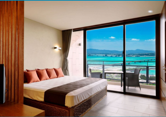
AWAY OKINAWA KOURI ISLAND RESORT