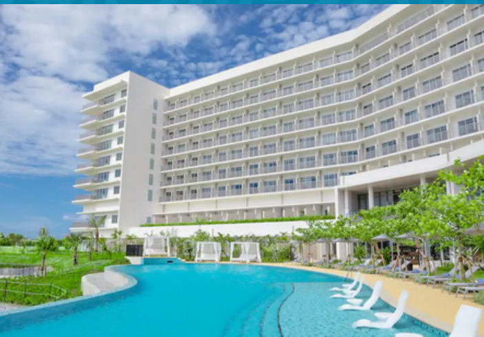
HILTON OKINAWA SESOKO RESORT