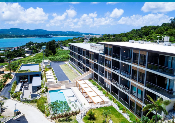
AWAY OKINAWA KOURI ISLAND RESORT