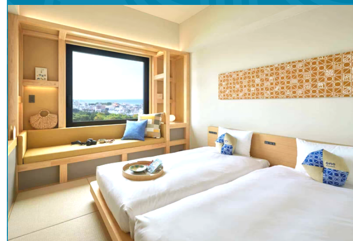
OM5 OKINAWA NAHA