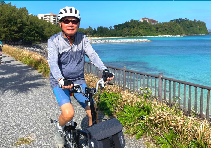
NAHA CITY RIDE