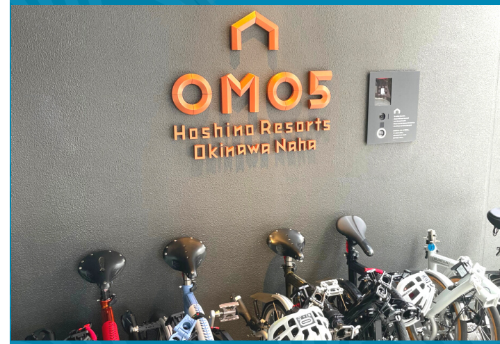
OM5 OKINAWA NAHA