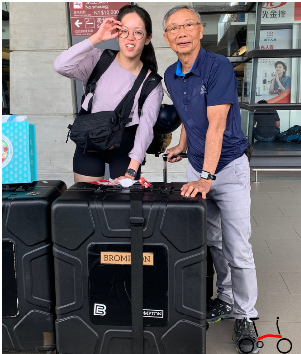
Guest Relations , Brompton Friendly