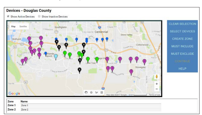
Enhanced Zone-Based Origin & Destination Studies OD Matrix from: Devices to Devices, Zones to Zones or Devices to Zone(s)

The Origin and Destination (OD) feature of BlueARGUS allows the user to select various combinations of installed BlueTOAD detectors to monitor traffic flow patterns and driver behavior. This data not only shows where trips began and ended, but also the sequence or chain of events that lead from the starting point to the end point of their trip. Users can create OD location zones made up of single or multiple BlueTOAD devices to represent a business district, university campus, or residential development, etc.