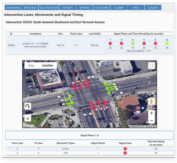
BlueARGUS Live Intersection View -SPaT & BSM display

The BlueARGUS live intersection view displays real time SPaT information as broadcast over 5.9 GHz spectrum using Dedicated Short Range Communications (DSRC) or Cellular Vehicle to Everything (C-V2X) available with the BlueTOAD Spectra Roadside Unit (RSU) for Vehicle-to-Infrastructure (V2I) information exchange with vehicles. The BlueARGUS system collects and processes lane-by-lane data and its associated signal phase information to initiate signal priority and preemption requests to the local traffic controller.