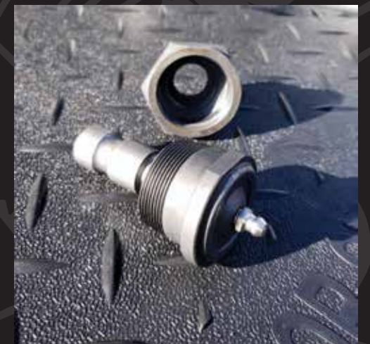
1. Remove dust boot from ball joint.