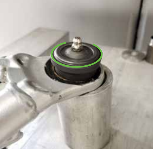
2. Press ball joint into arm until seated properly. Apply force only on the HIGHLIGHTED AREA.