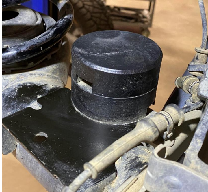
Figure 4. Rear Bump Stop Correctly Installed on JL Wrangler