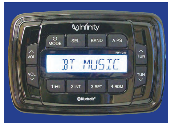
INFINITY™ AUDIO SYSTEM