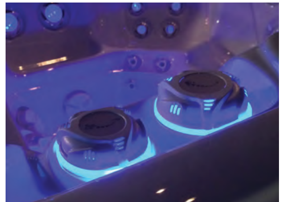
AIR AND WATER DIVERTERS