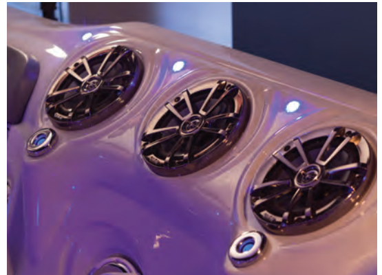
INFINITY™ AUDIO SPEAKERS