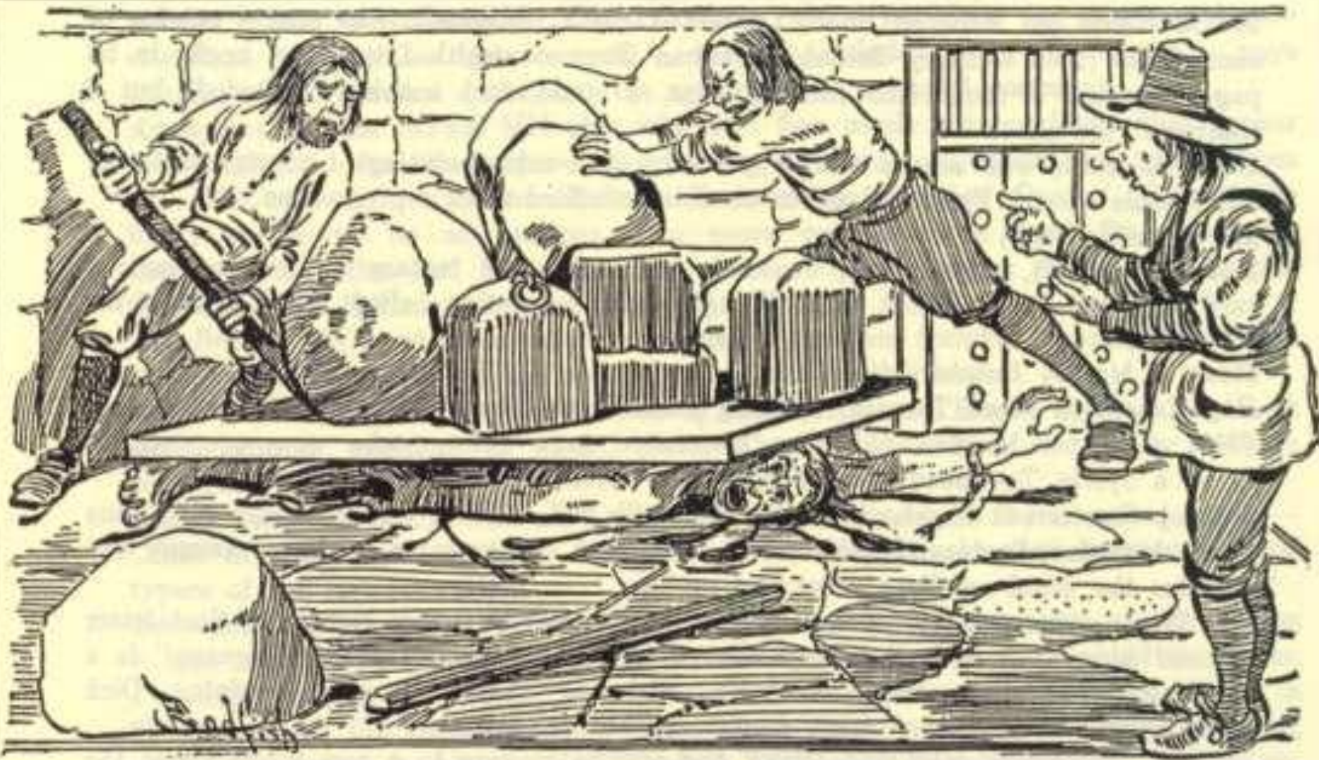
Pressing Giles Corey to Death.