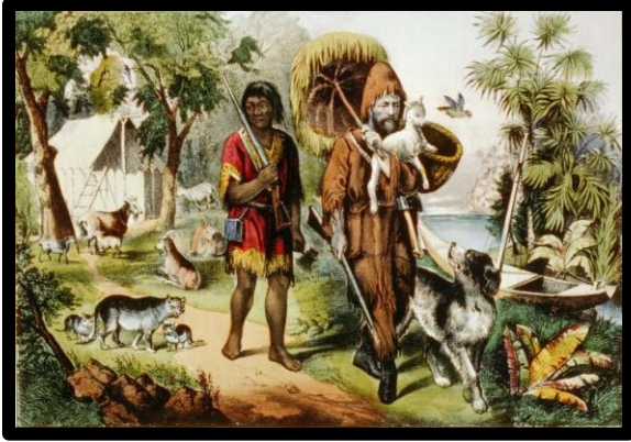
ROBINSON CRUSOE BY DANIEL DEFOE