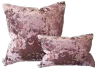
Crushed Velvet in Rose