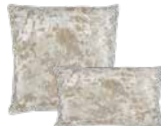
Crushed Velvet in Glaze