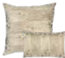
Timber in Drift