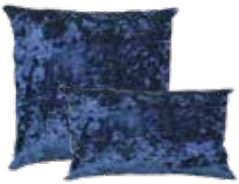
Crushed Velvet in Royal

Aviva's eyes are always looking for amazing fabrics to bring into her line. Once in a while she finds something that she just can't live without. In this collection, we see all her favorites; a peak into her private fabric library. Her personal selections are all about textures, sheen, and engaging surfaces. All colors are deliberately chosen to work back into all her Signature looks. We hope you'll agree that they are indeed irresistible.