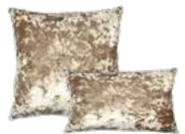
Crushed Velvet in Taupe