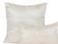
Sage Aura Wave