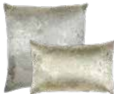
Estate in Silver*