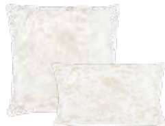
Crushed Velvet in Ivoire