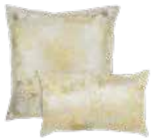
Estate in Champagne*