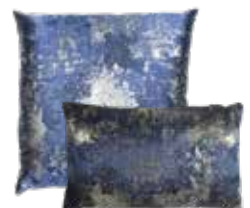
Estate in Blue*