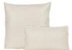
Sage Aura Slub