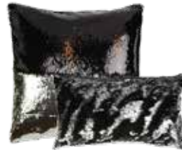
Sequin in Black-Silver