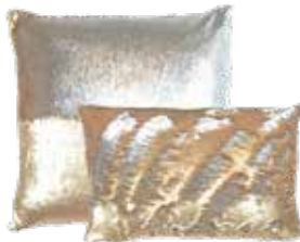
Sequin in Citrine