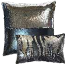
Sequin in Solana