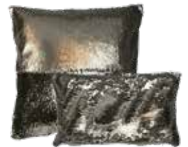
Sequin in Smoke-Chrome