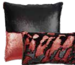
Sequin in Red/Black