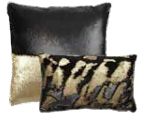
Sequin in Black-Taupe