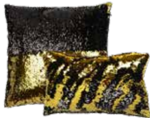
Sequin in Black-Gold