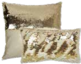
Sequin in Champagne