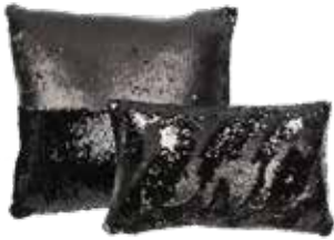
Sequin in Black-Black

When we moved the design studio to Southern California, from NYC, we realized there that the endless summer lifestyle is an every day occurrence in some parts of the world. We all want to be taken away and swim with the mermaids. In this collection, Aviva channels her inner mermaid. The pillows become personal sensory canvases, perfect for a daydream, writing an intention for the day or just letting your artistic self be.