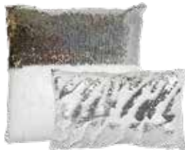
Sequin in White-Silver