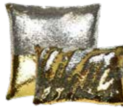
Sequin in Gold-Silver