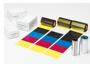
Ink Ribbon & Retransfer Film

*CX-D80 series is prohibited to export/re-export to Cuba, Iran, North Korea, Sudan and Syria by Export Administration Regulations of USA.