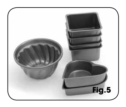
DIMENSIONS: Square: 7.5cmx7.5cm, Heart: 10cmx10cm, Bundt: 11cm diameter.

For baking, small baking tins that fit the air frying oven basket can be purchased from most homecare stores. Refer below examples (See Fig.5).