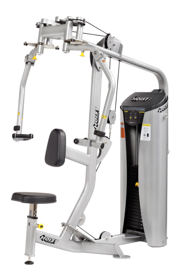
PIVOTING HAND GRIPS