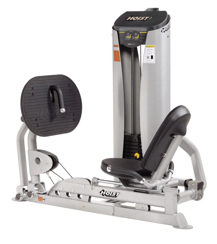
OVERSIZED NON-SLIP PLATE