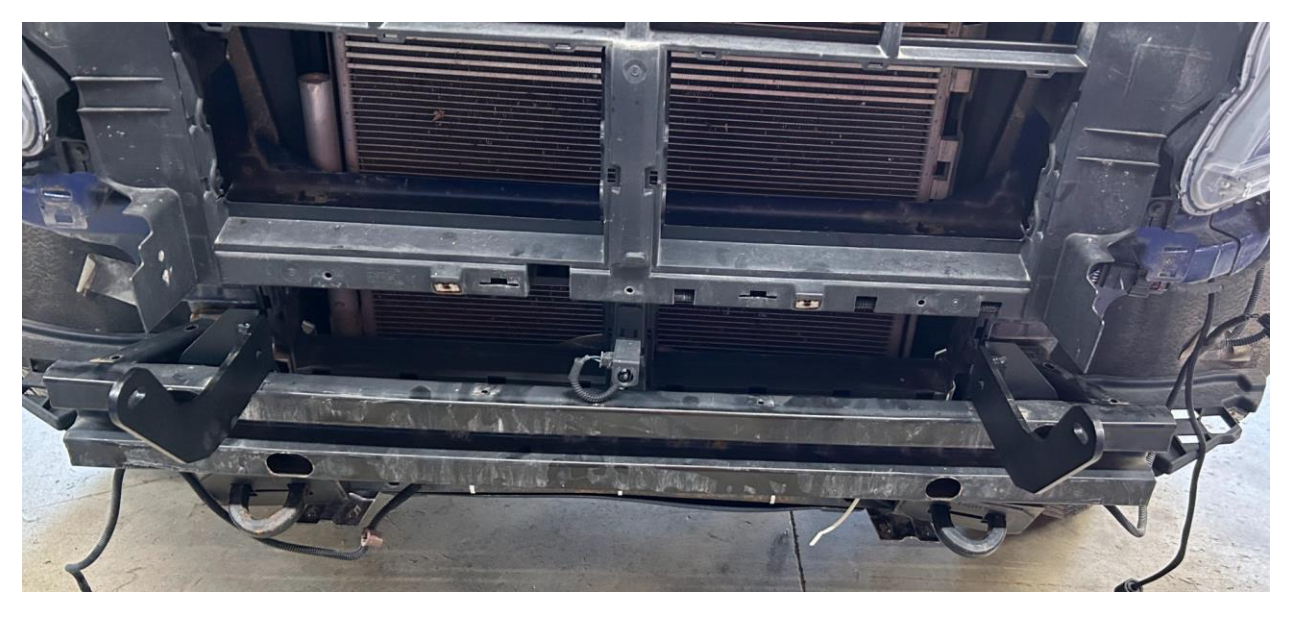
Step 5: To reinstall the air dam, you will need to trim the sides off, so it can fit between the frame brackets. Reinstall all push clips after trimming. * Now is a good time to run the wiring for your lights.

Step 4: Locate the bracket for that side and slide it behind the crash bar and loosely install the factory 15mm head bolts. Do the same for the opposite side and tighten all four bolts back down to 48 lbsft.