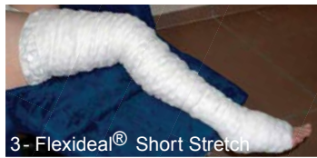
3 - Flexideal® Short Stretch