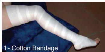
1 - Cotton Bandage