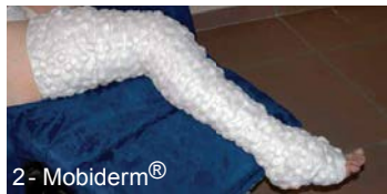
2 - Mobiderm®