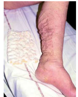
Before → 5 days → After