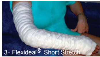
3 - Flexideal® Short Stretch