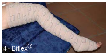
4 - Biflex®