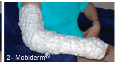
2 - Mobiderm®