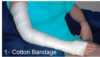
1 - Cotton Bandage