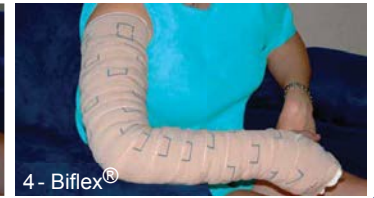
4 - Biflex®

INDICATIONS: Lymphoedema, venous oedema, post-traumatic oedema