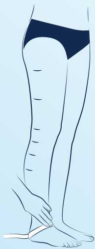
Circumference at the instep