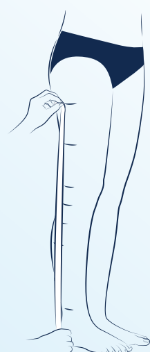
Height measurement (position of measuring tape on the external face of the leg)