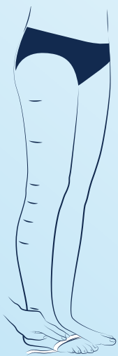
Circumference of the head of the metatarsal bones

All markers are positioned on the external face of the leg