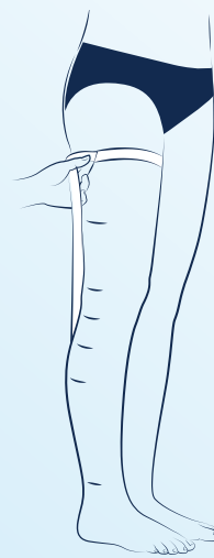
Circumference of the thigh (at the gluteal fold)