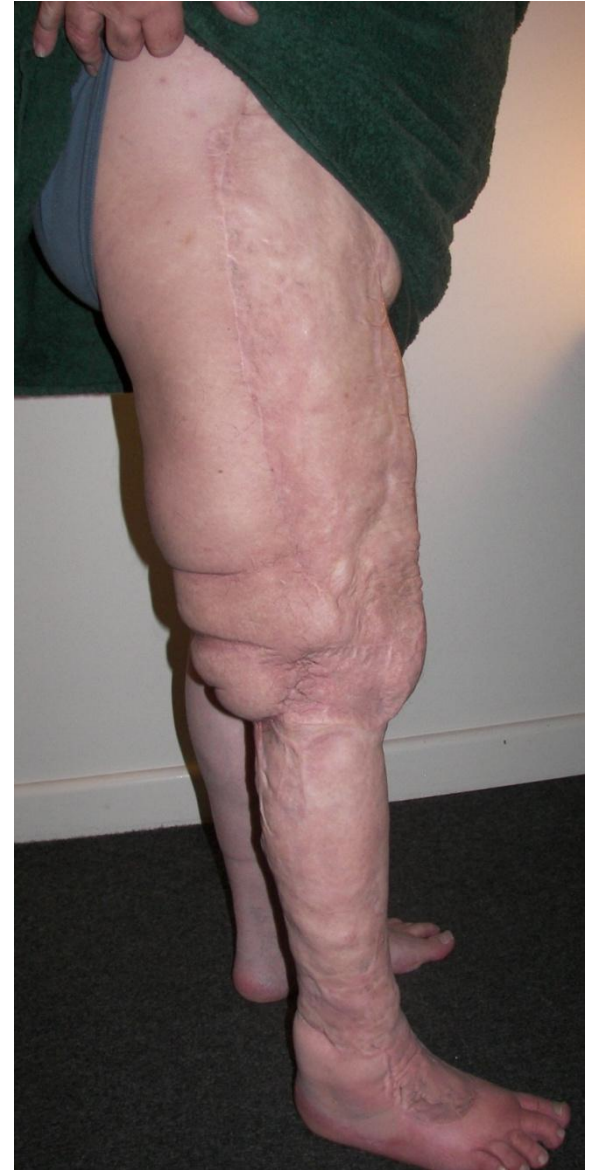
Lateral view right leg