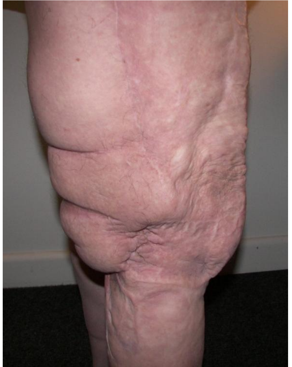
Close up right thigh and knee