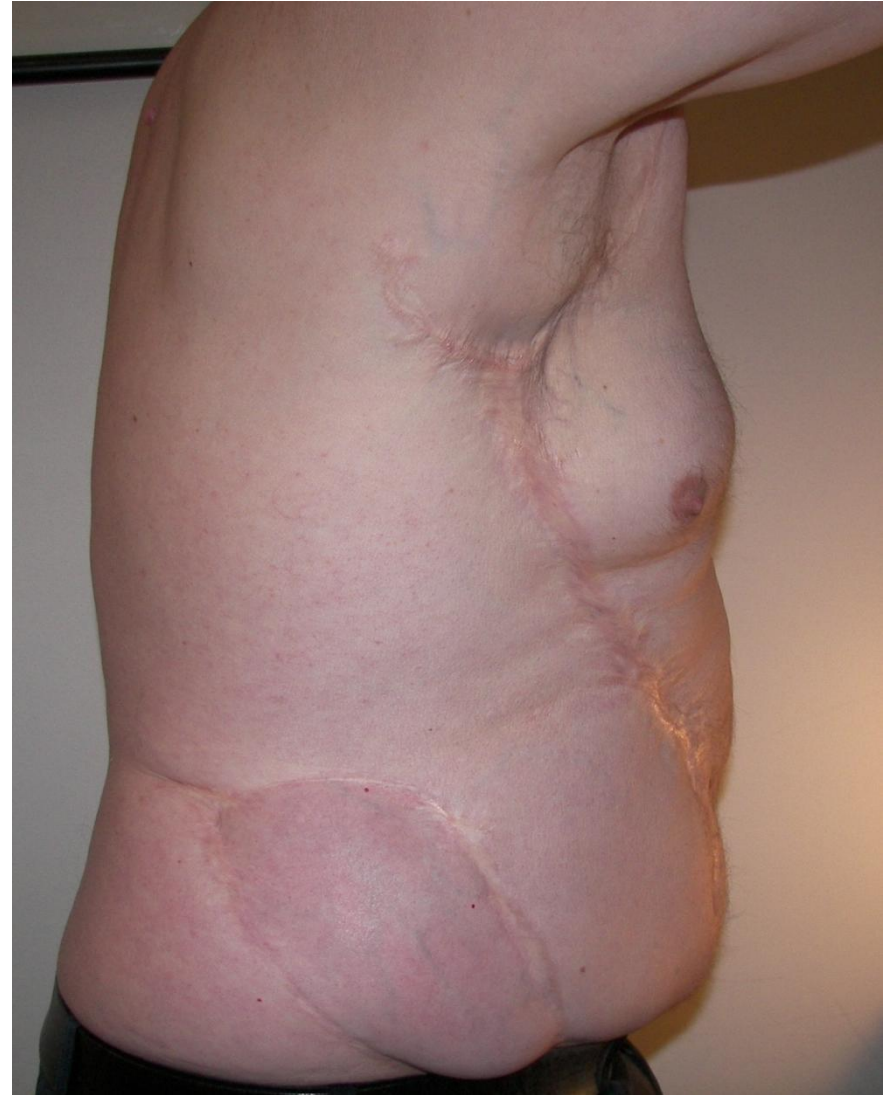
Lateral view right side