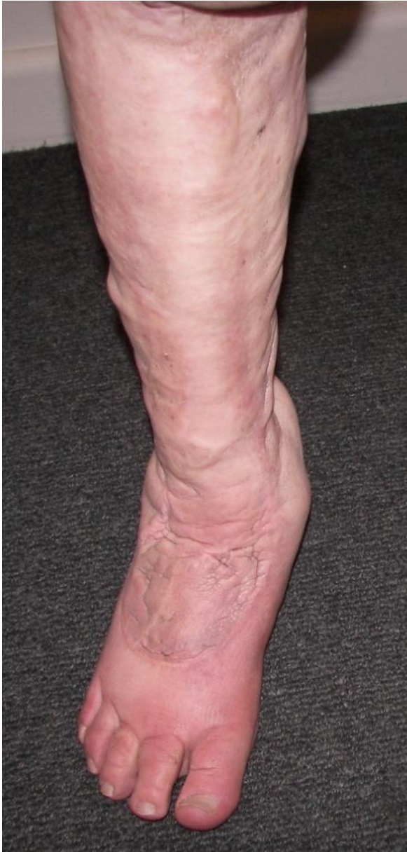
Close up right lower limb