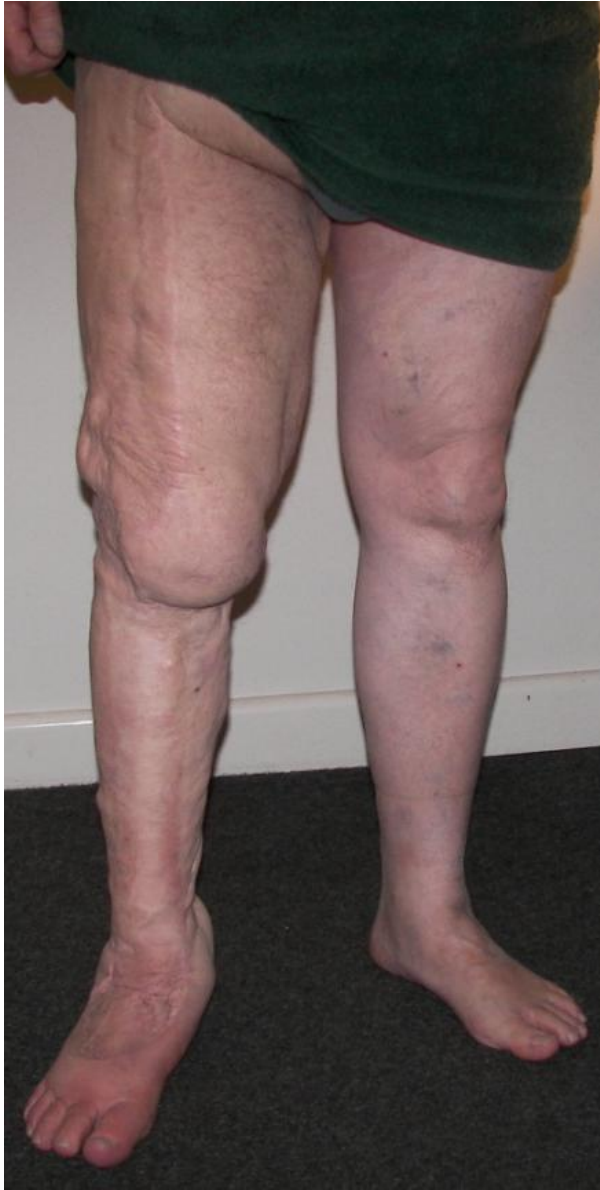
Anterior view right leg