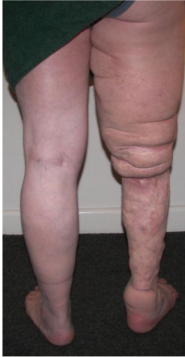
Posterior view right leg