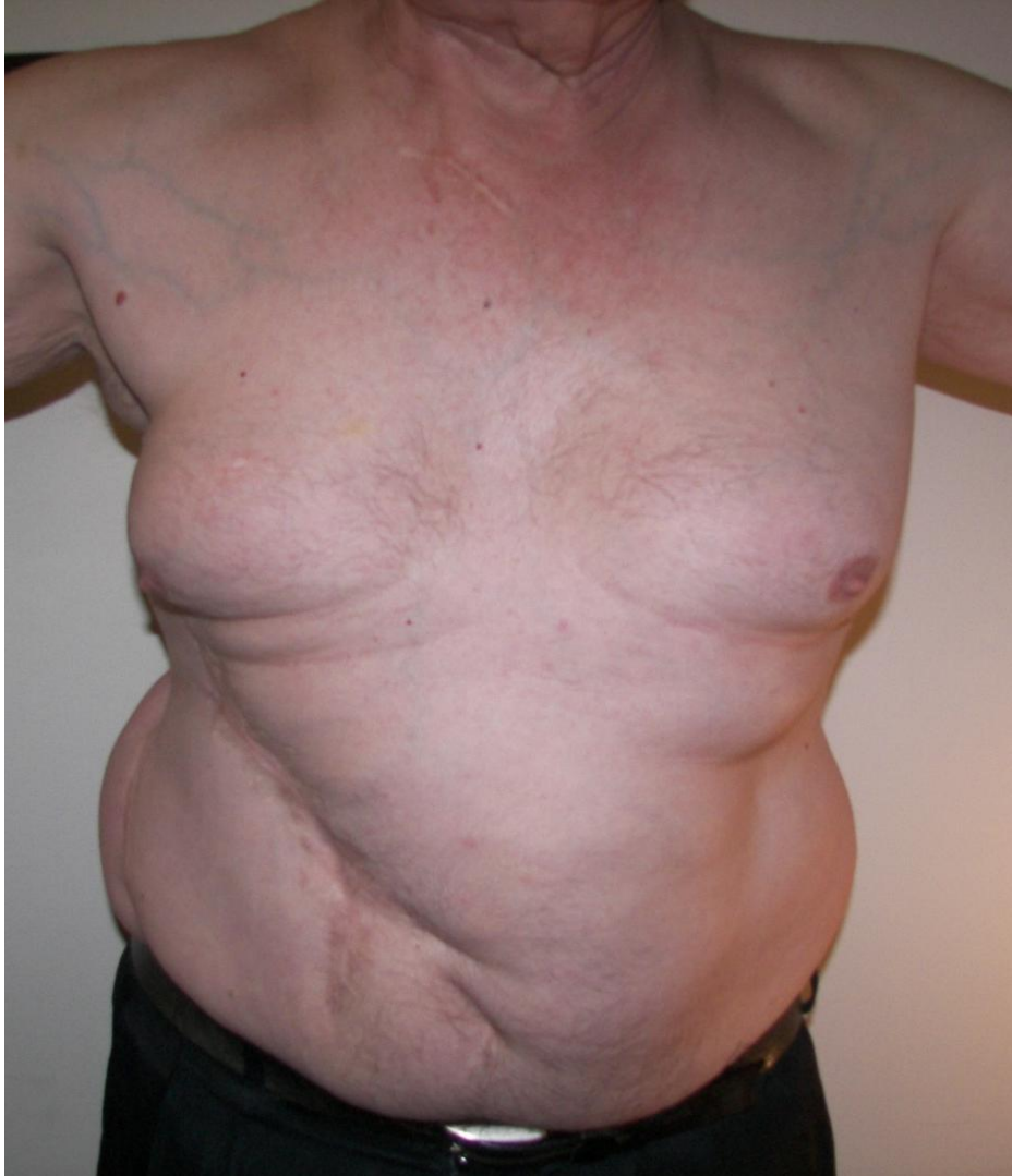
Anterior view chest