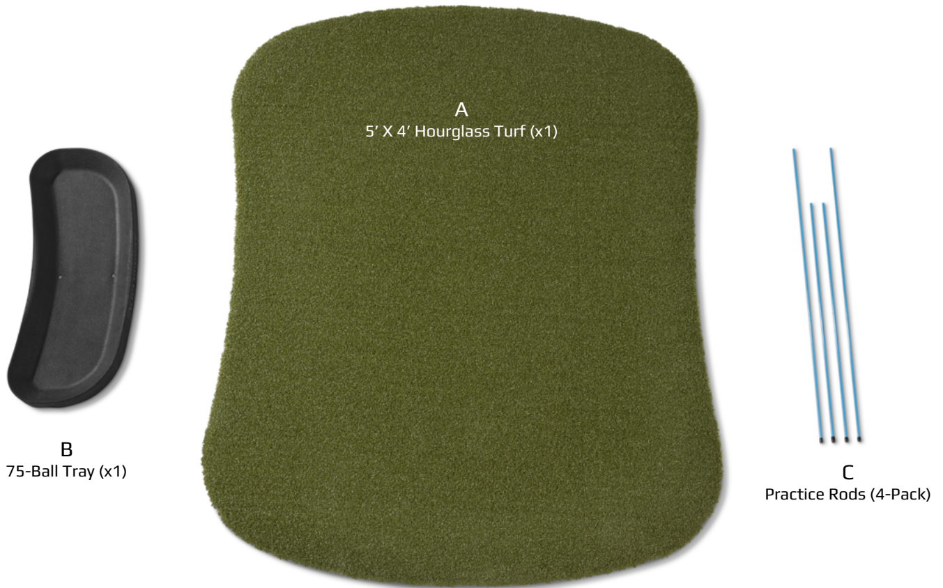
B 75-Ball Tray (x1)

NOTE: We ship our turf folded in the box for the most expedient shipping. During transit, the turf pieces may curl slightly. If your turf is curled upon delivery, we recommend laying the turf pieces flat in the sun for a couple of hours to allow them to relax and flatten prior to usage.