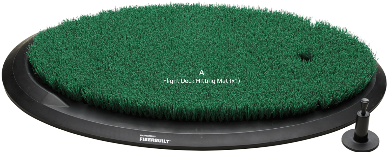
A Flight Deck Hitting Mat (x1)