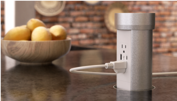
Point Pod Connect Silver – PPCV815