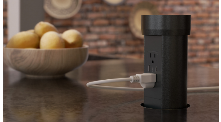
Point Pod Connect Black – PPCV815B