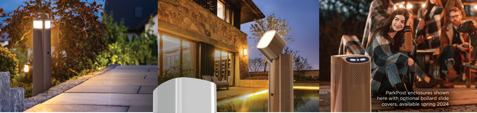
ParkPost enclosures shown here with optional bollard slide covers, available spring 2024