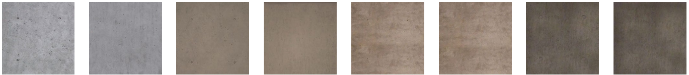
Industrial Grey 'Circles' Industrial Grey 'Flat' Washed Grey 'Circles' Washed Grey 'Flat' Rustic Grey 'Circles' Rustic Grey 'Flat' Onyx Grey 'Circles' Onyx Grey 'Flat'