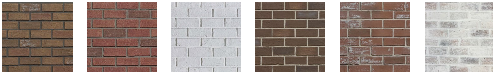
Antique Old Italy Vintage White Cellar Brown Reclaimed Red Lime Wash