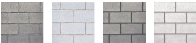
Traditional Washed Grey Traditional Industrial Grey Modern Washed Grey Modern Industrial Grey