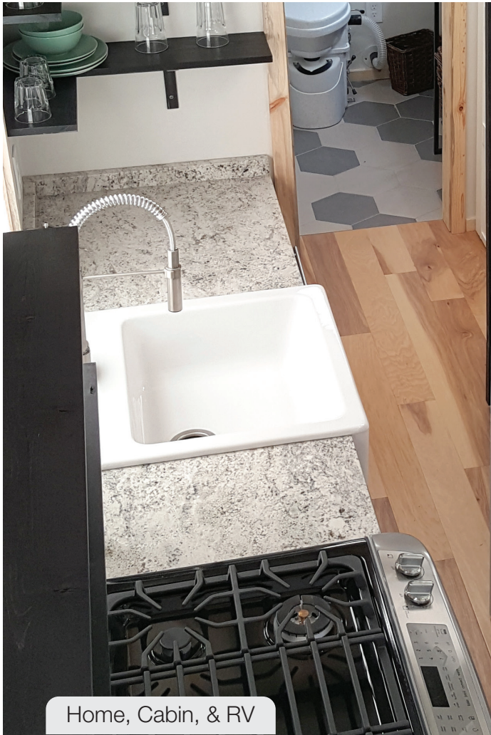
Home, Cabin, & RV