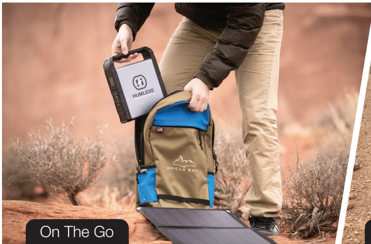
On The Go