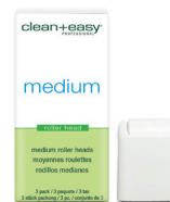
medium roller heads 3 pack medium 41635