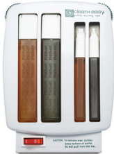
petite waxing spa warmer For Petite Kit. Warmer only. A40007C