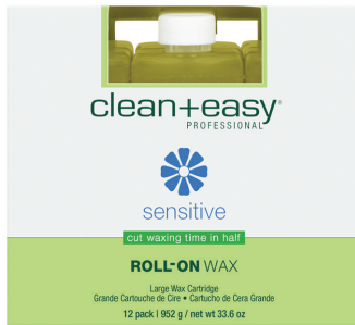
12 pack large 41212

All purpose wax made with natural bees wax that can be used for facial and body waxing for all skin types.