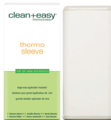
thermo sleeve roll on wax accessory 1 count 40225