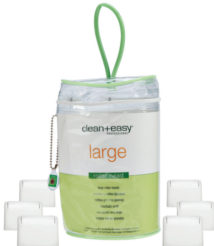
large roller heads 24 pack large 41643