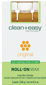
3 pack large 41631