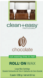
3 pack large 47342