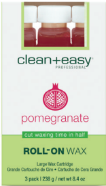
3 pack large 47344

This crème wax is infused with cacao bean extract which is a powerful antioxidant that helps protect the skin.