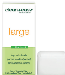
large roller heads 3 pack large 41238