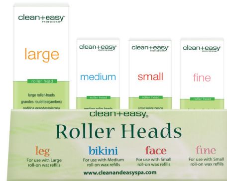
roller head display 24 PC 41638