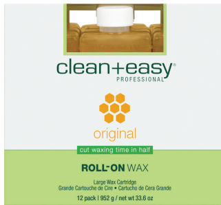
12 pack large 41612