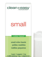
small roller heads 3 pack small 41637