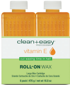
6 pack large 47350

Hemp seed oil helps reduce skin irritation and is known for its hydrating properties. Ideal for dry and sensitive skin.