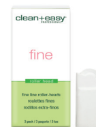
fine roller heads 3 pack fine 41636