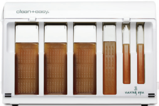
waxing spa warmer For Basic Kit and Full Service Kit. Warmer only 40201