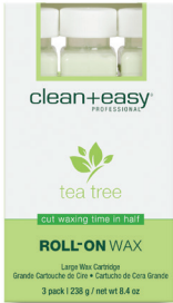
3 pack large 47352