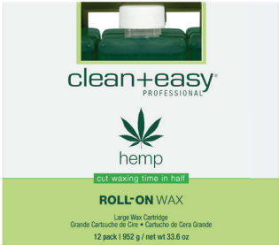
12 pack large 41611