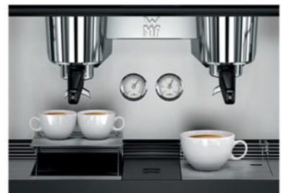
Double-sided, upward-folding cup grids Providing optimal pouring height for cups.