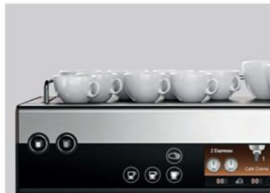
Heated cup storage With soft closure.