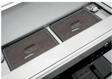
Air-cooled bean hoppers For two different varieties of coffee bean.