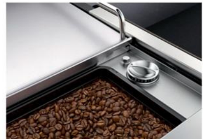
Brew-time monitoring Monitoring and software-assisted grinding degree setting.