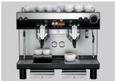
Two integrated grinders and automatic tamping. (Fig. with additional feet and two trays for coffee grounds)