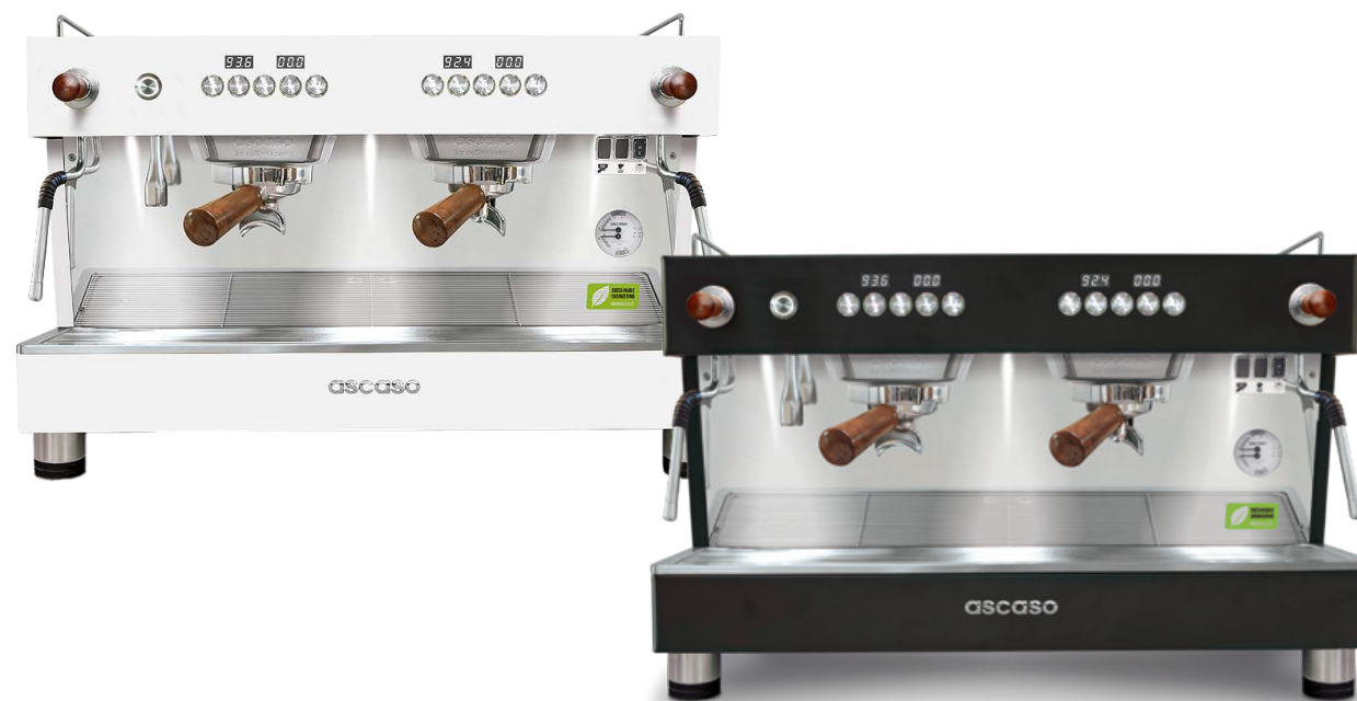
2GR Joystick B&W