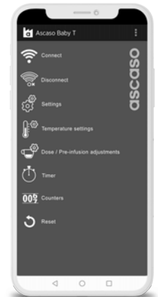
AscasoApp. Total control

We deliver a 50% average saving compared with a traditional machine and 25% compared with other multiboiler machines.